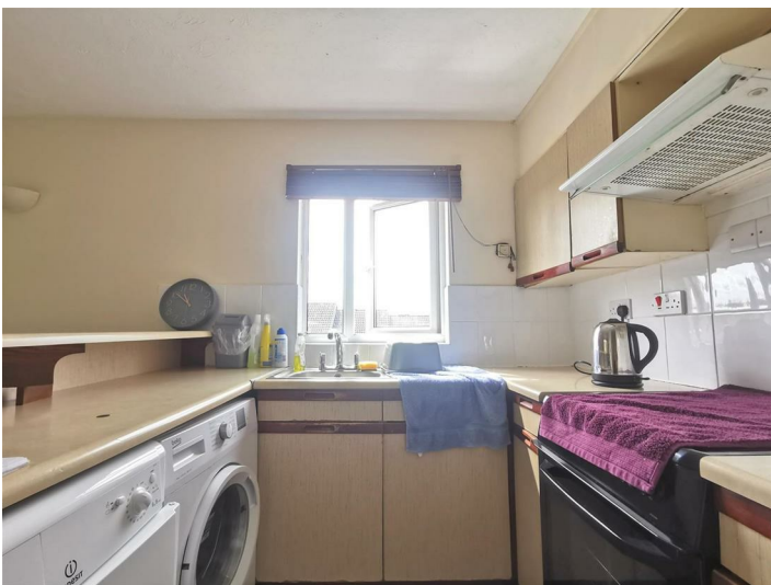
Range of wall and base units, electric cooker with extractor hood over, washing machine, double glazed window to rear aspect, tiled throughout.