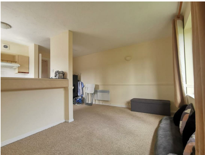
Double glazed window to side aspect and laid to carpet.