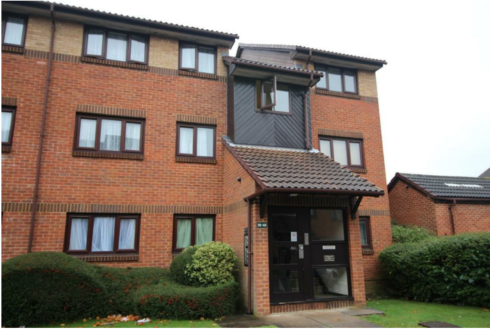
Fob access, stairs leading to second floor entrance.